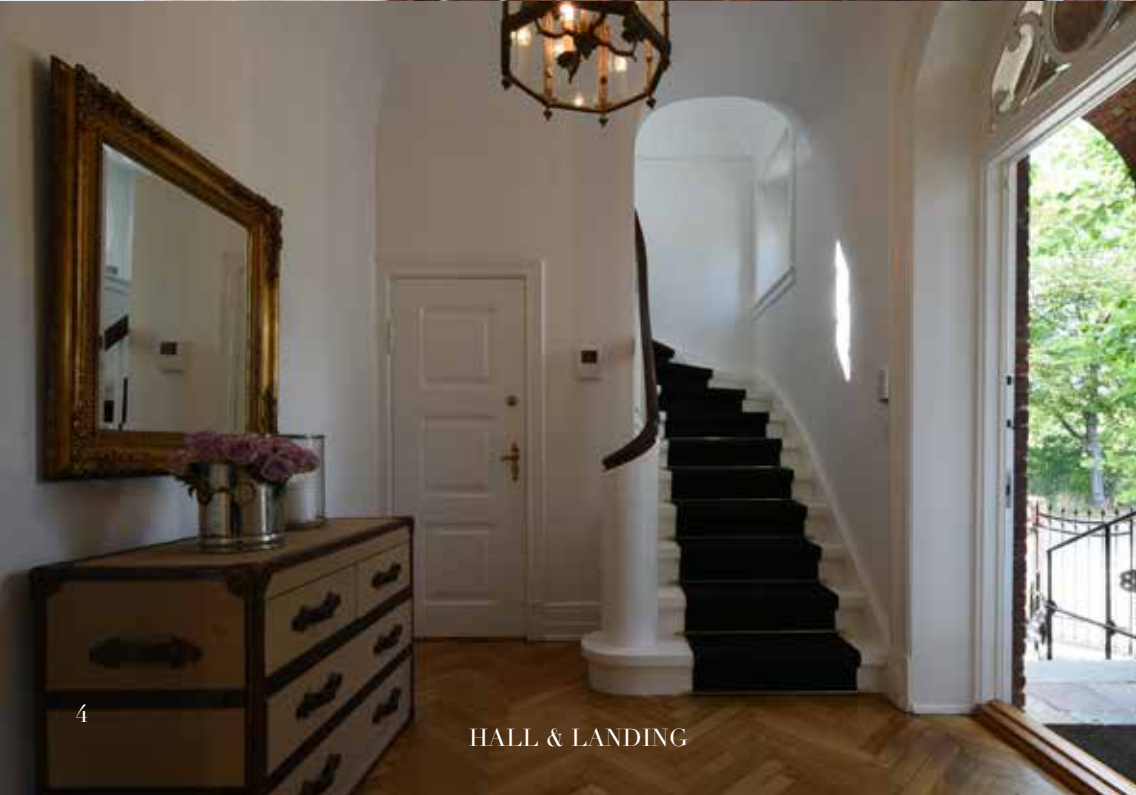
HALL & LANDING