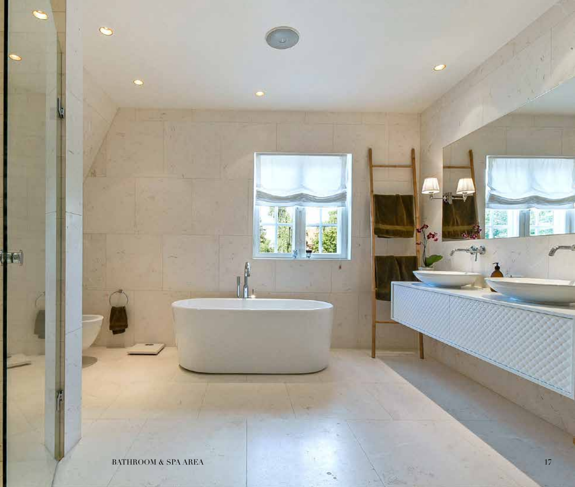
BATHROOM & SPA AREA